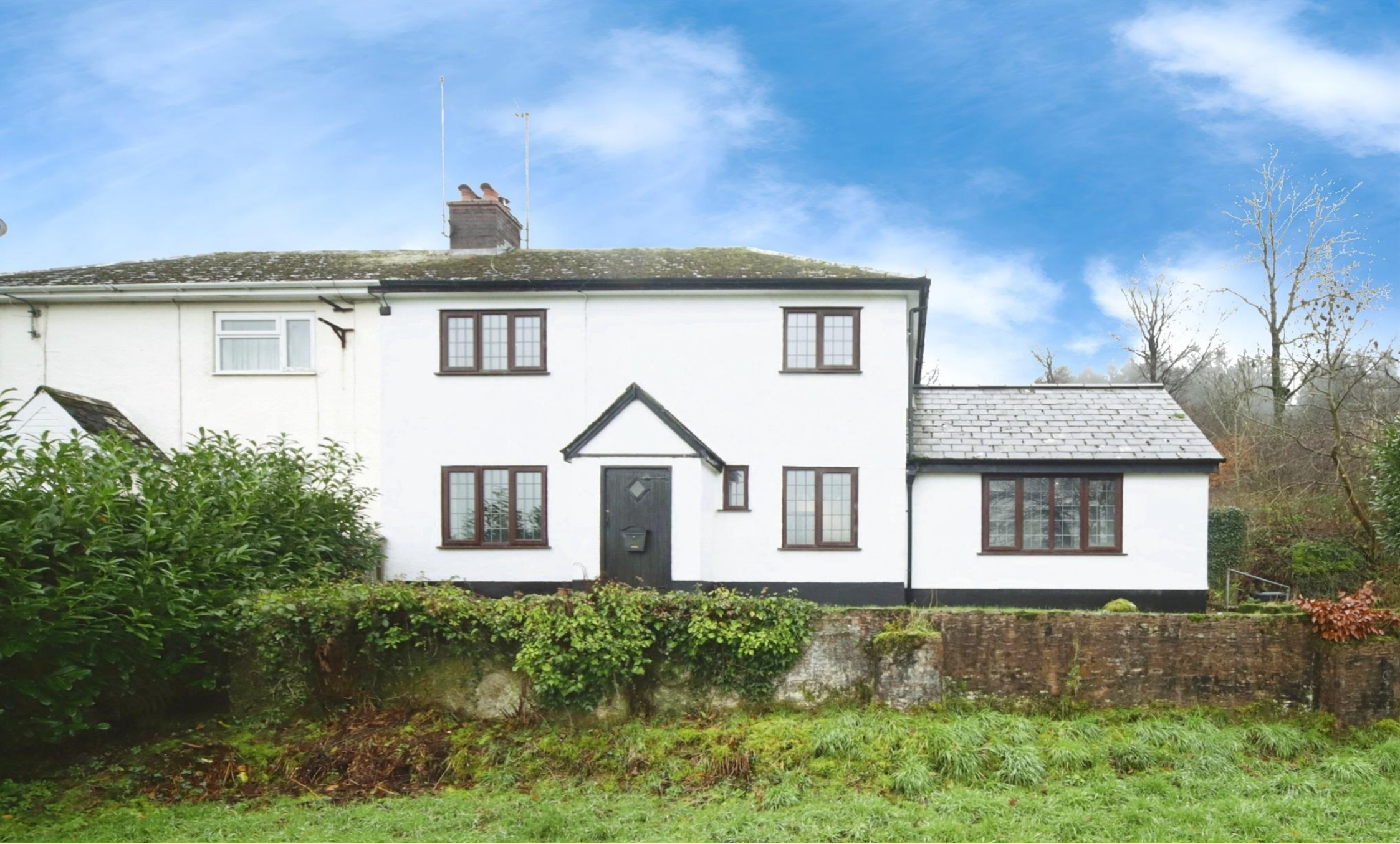
Eastwood, Upton Taunton TA4 2HX