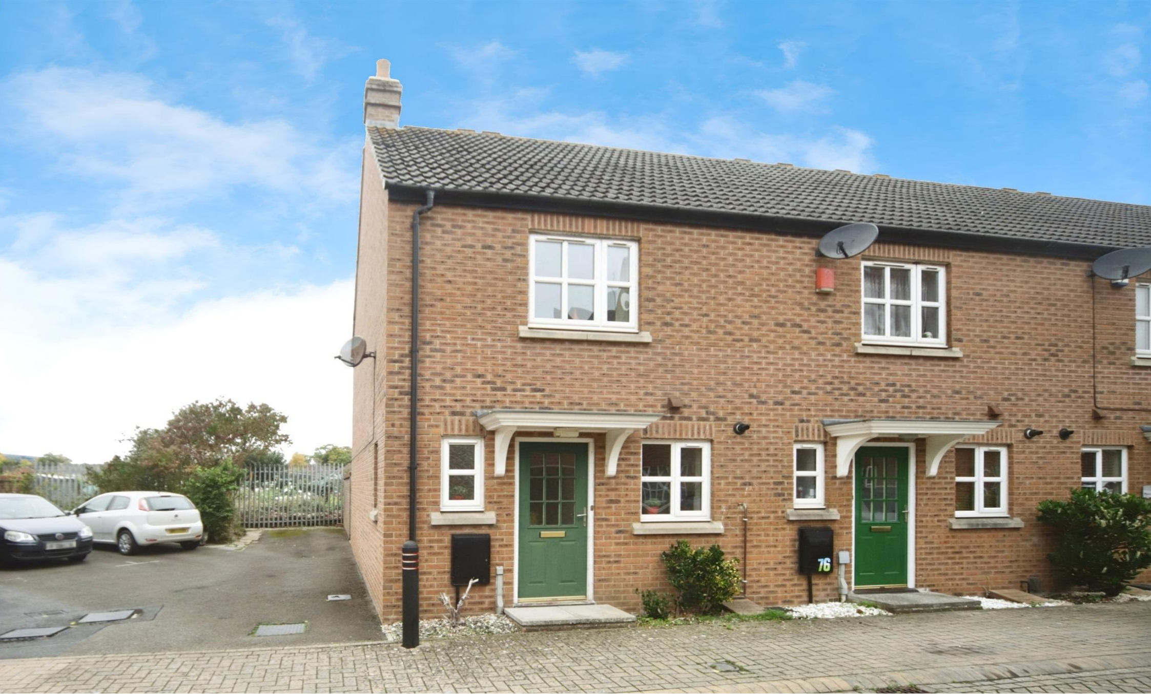
Massingham Park, Taunton TA2 7TQ