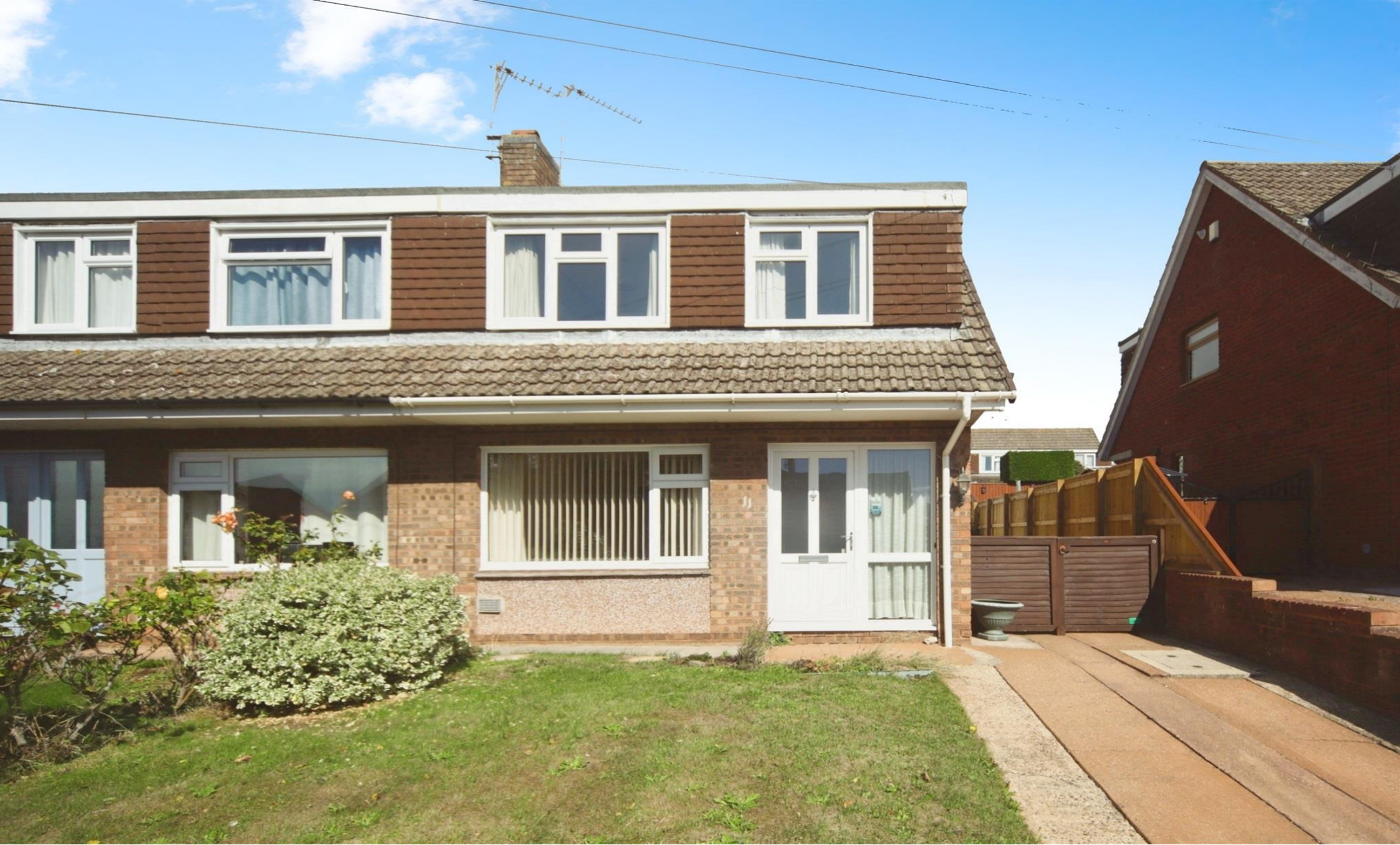
Queens Down, Creech St. Michael Taunton TA3 5QY