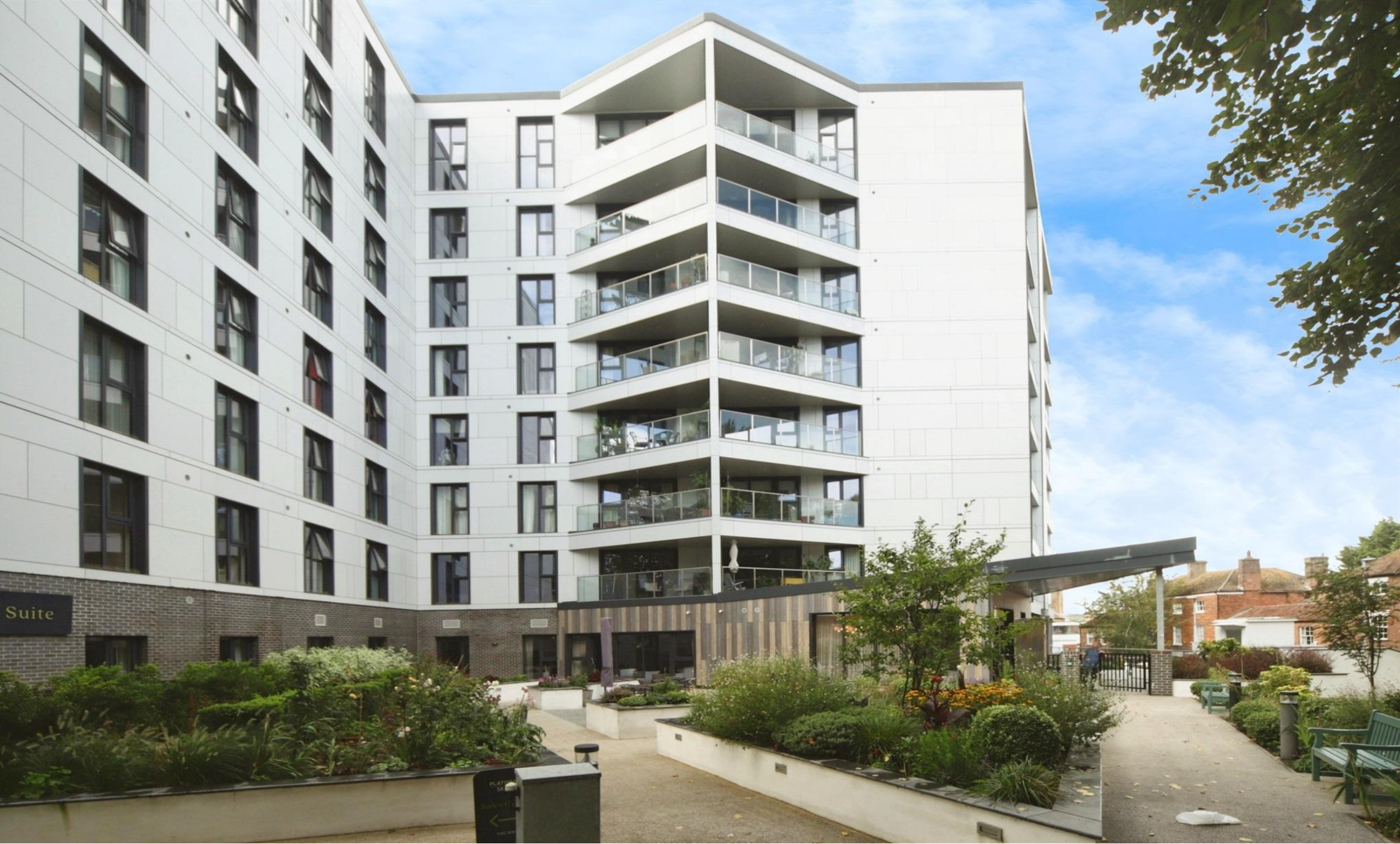
Quantock House Paul Street, Taunton TA1 3FY