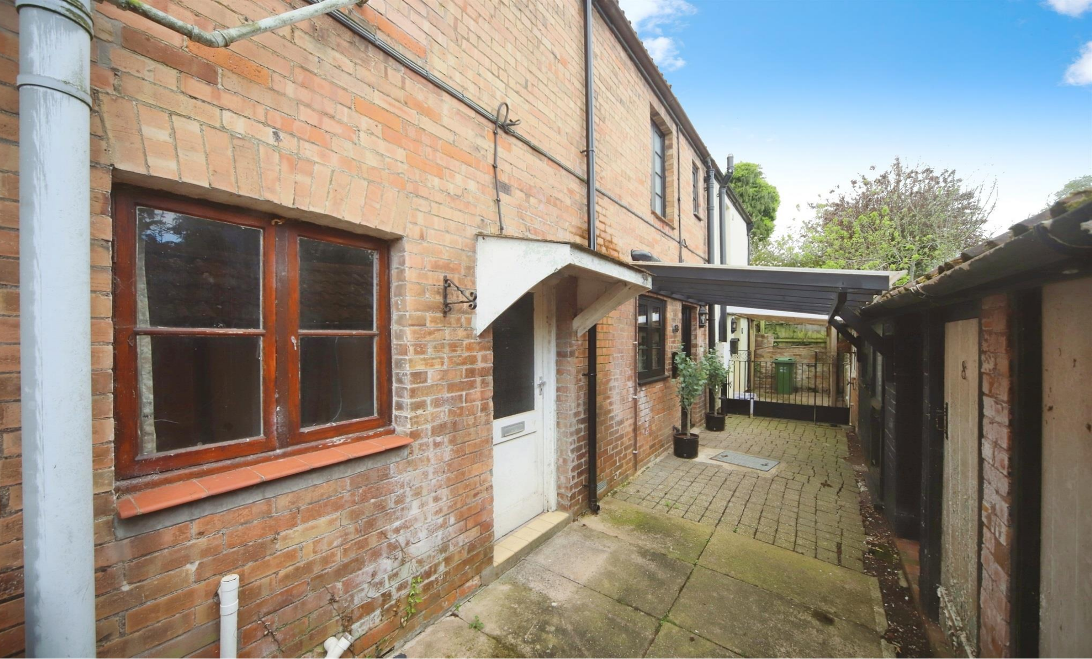
South View Terrace, Trull Taunton TA3 7JX