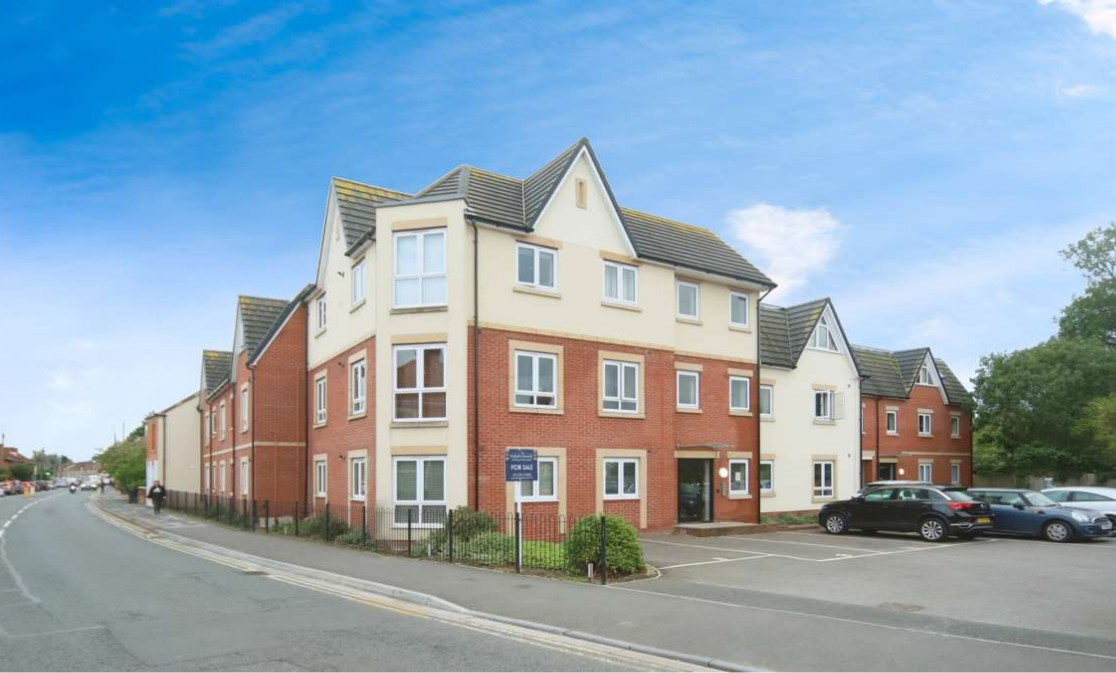
Carnival Court Taunton Road, Bridgwater TA6 6AF