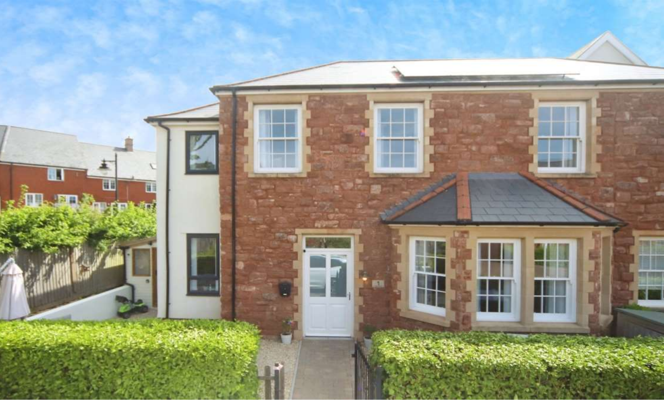
Lodge House Graham Way, Cotford St. Luke Taunton TA4 1GQ