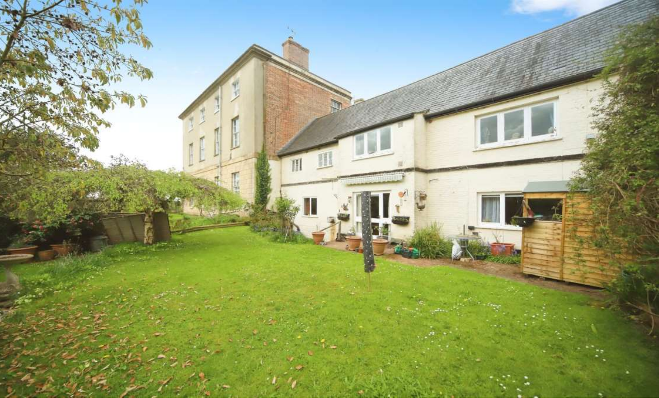
Flat 7 Walford House, Walford Cross Taunton TA2 8QW