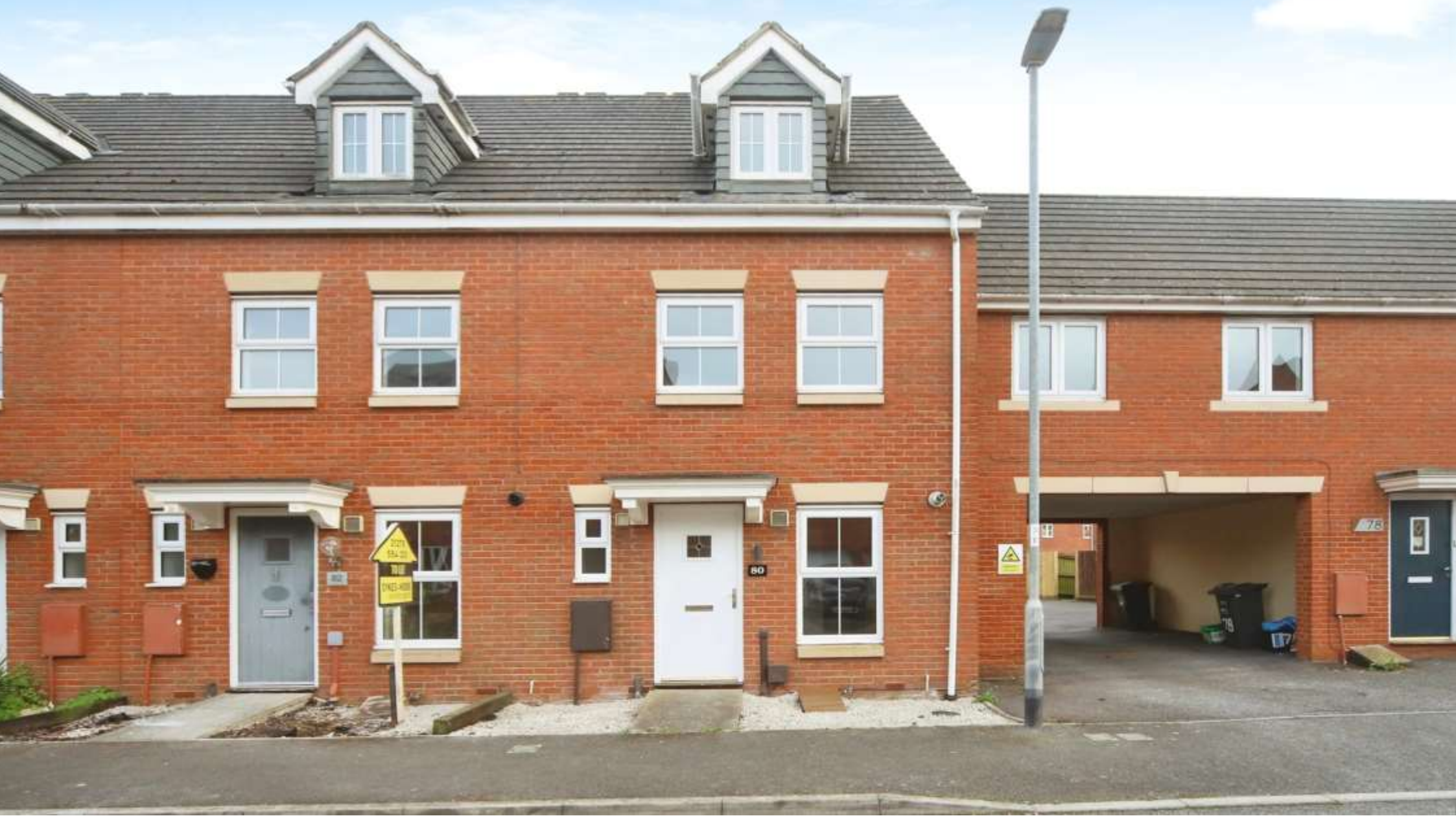
Meadowlands Avenue, Bridgwater TA6 3UA