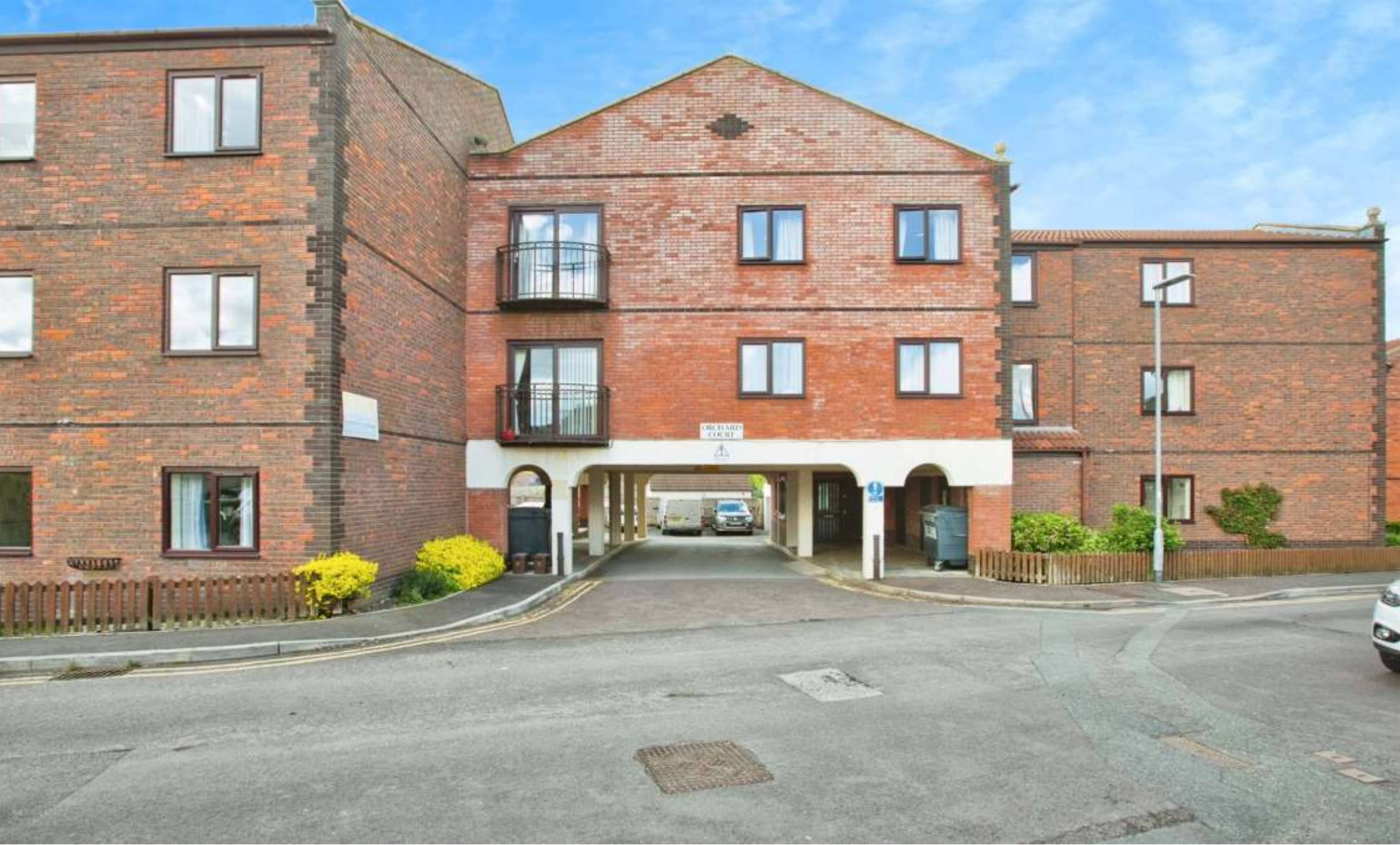
Orchard Court Orchard Road, Street BA16 0BA