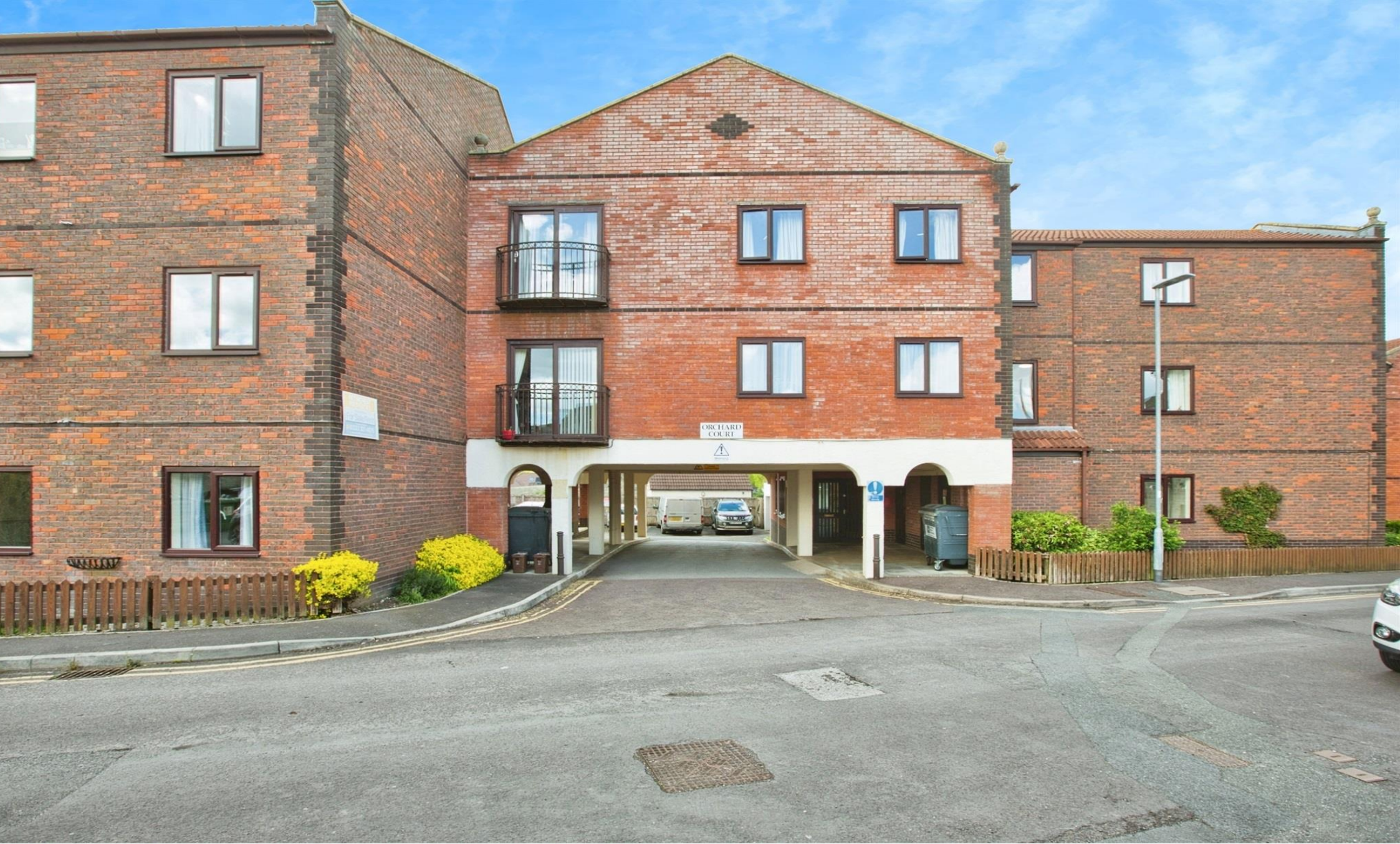
Orchard Court Orchard Road, Street BA16 0BA