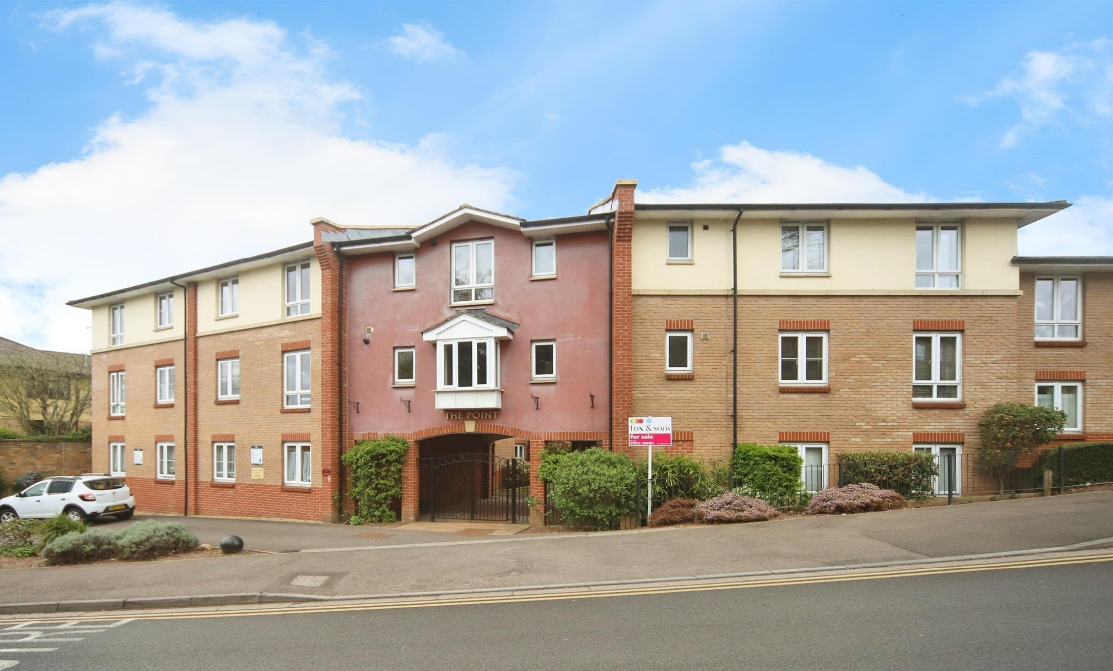
The Point Compass Hill, Taunton TA1 4AG