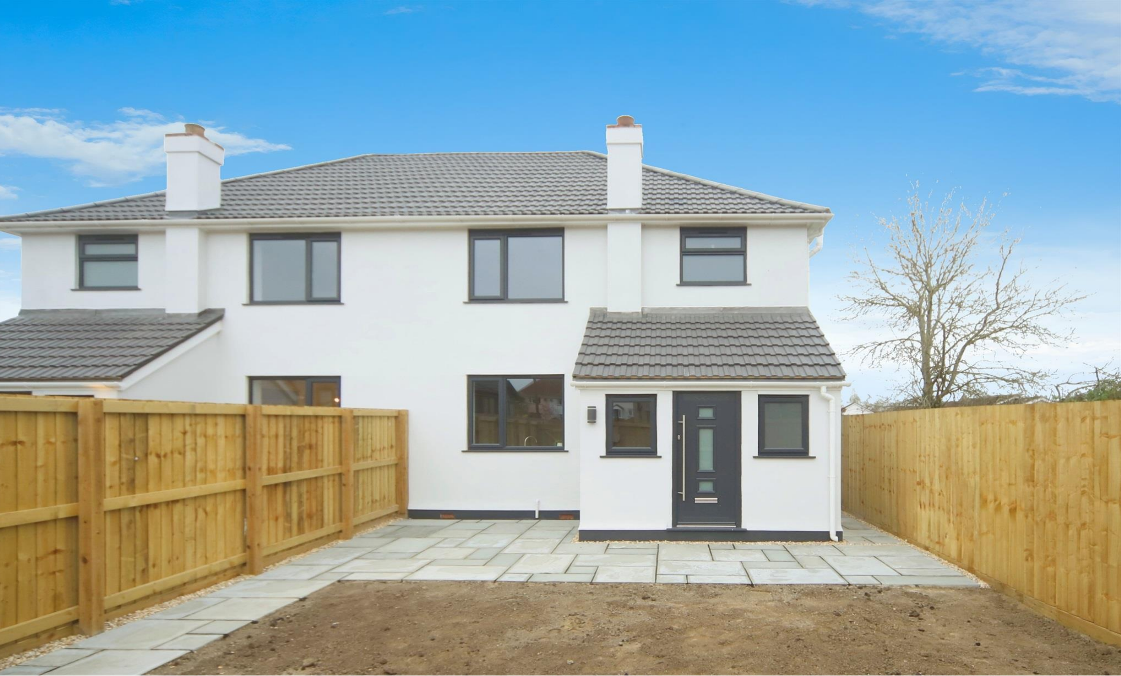
Fitzwarren House Wiveliscombe Road, Norton Fitzwarren Taunton TA2 6QJ