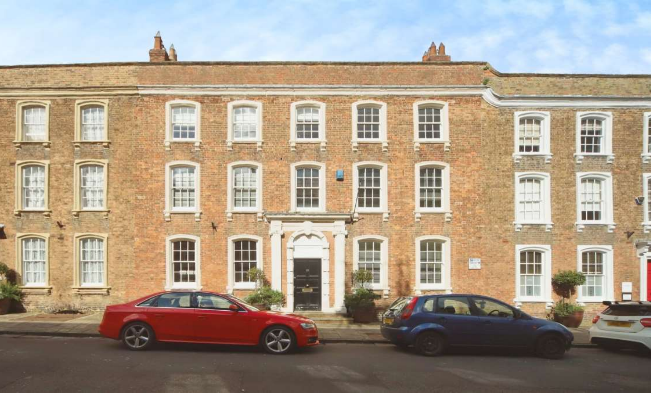
Castle Street, Bridgwater TA6 3DB