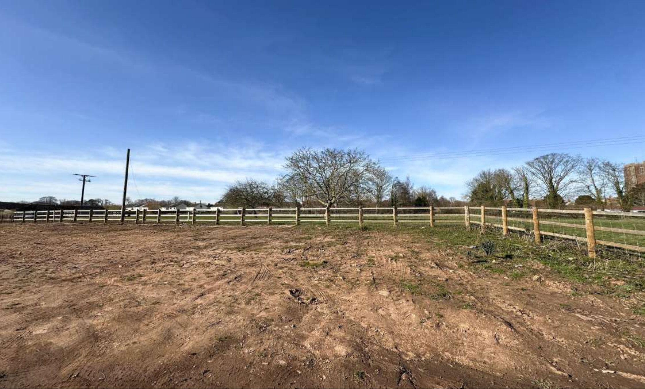
Plot 2 Denmans Lane, Cannington Bridgwater TA5 2LH