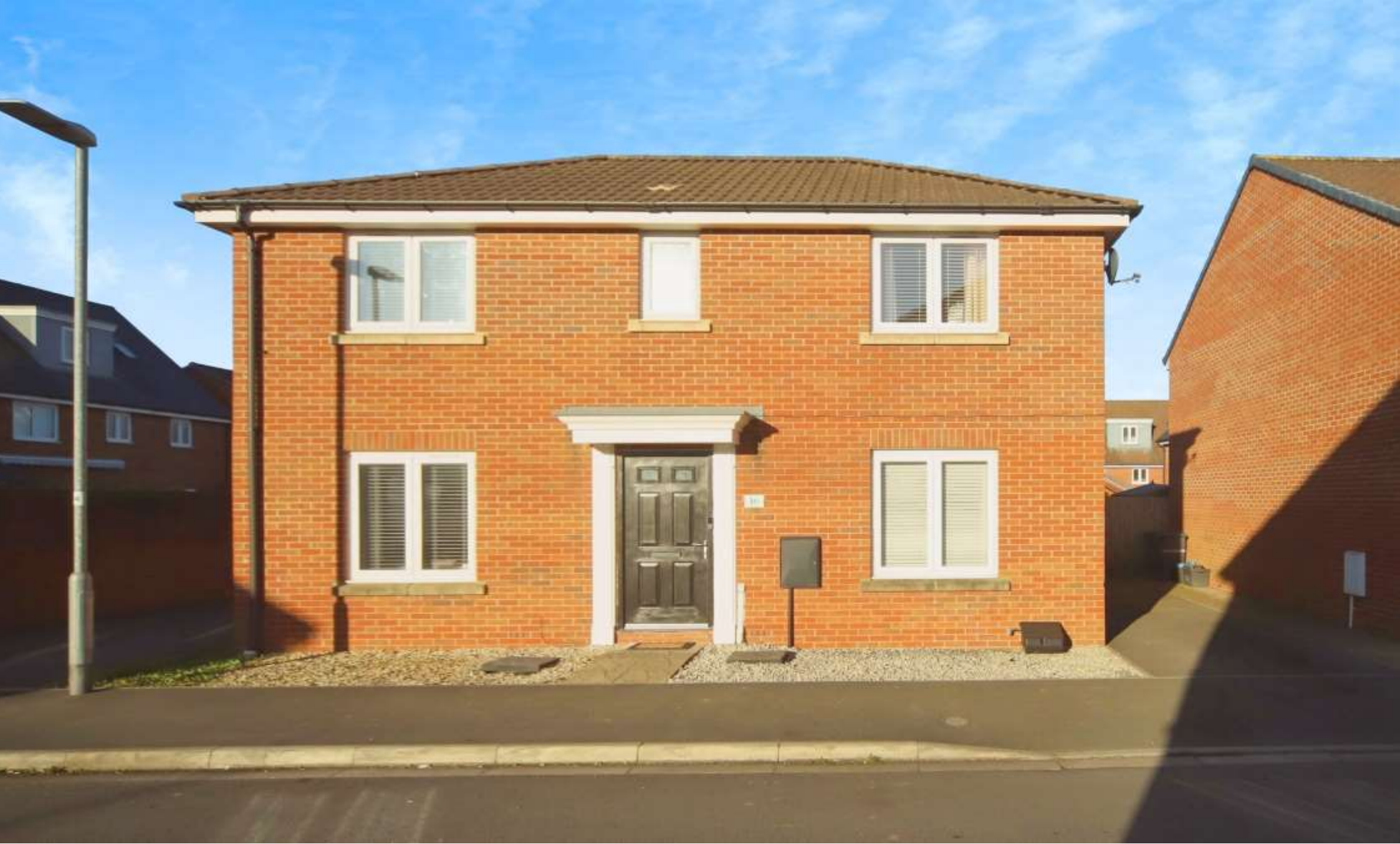
Dragon Rise, Norton Fitzwarren TAUNTON TA2 6FB