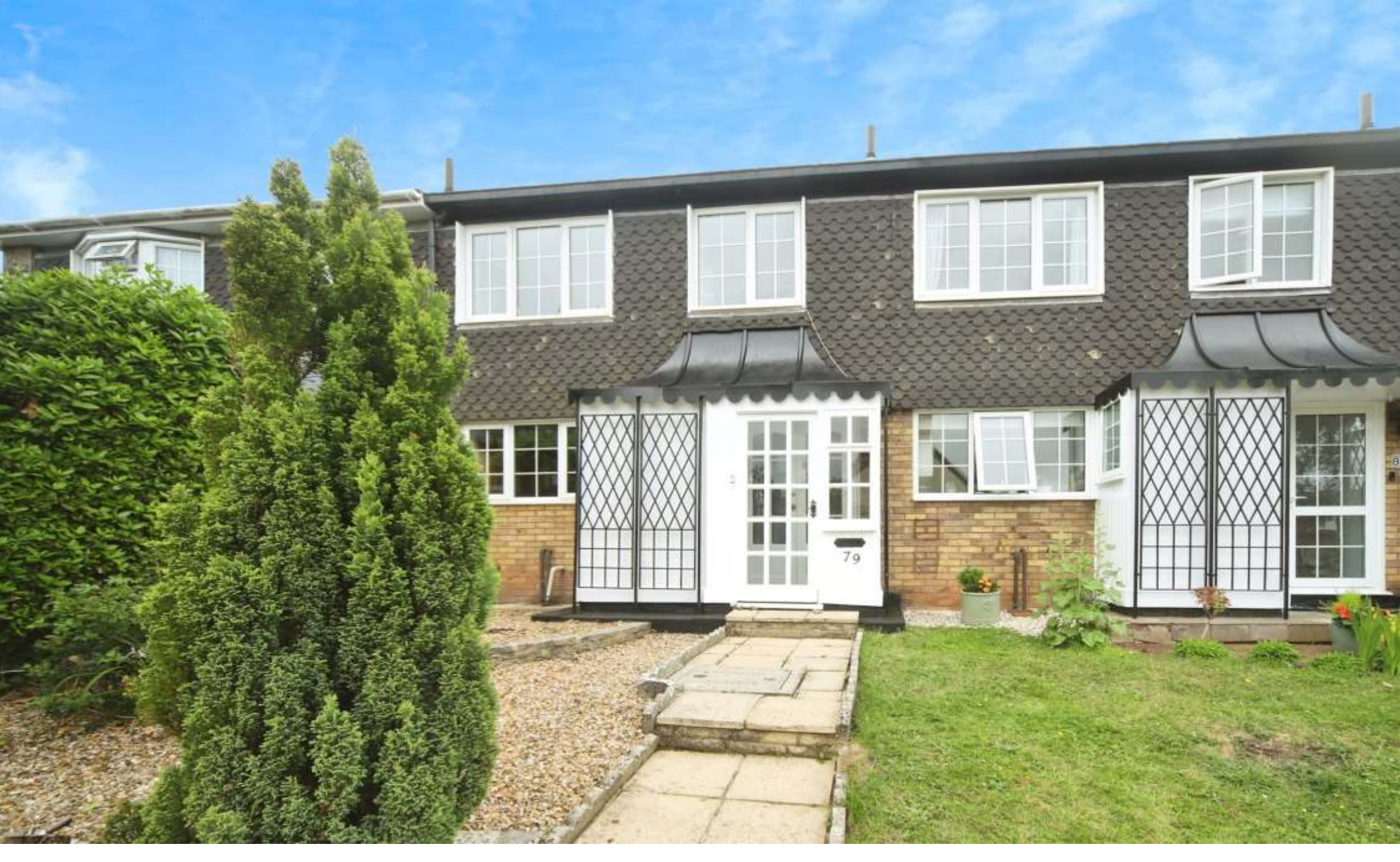
Pikes Crescent, Taunton TA1 4HU