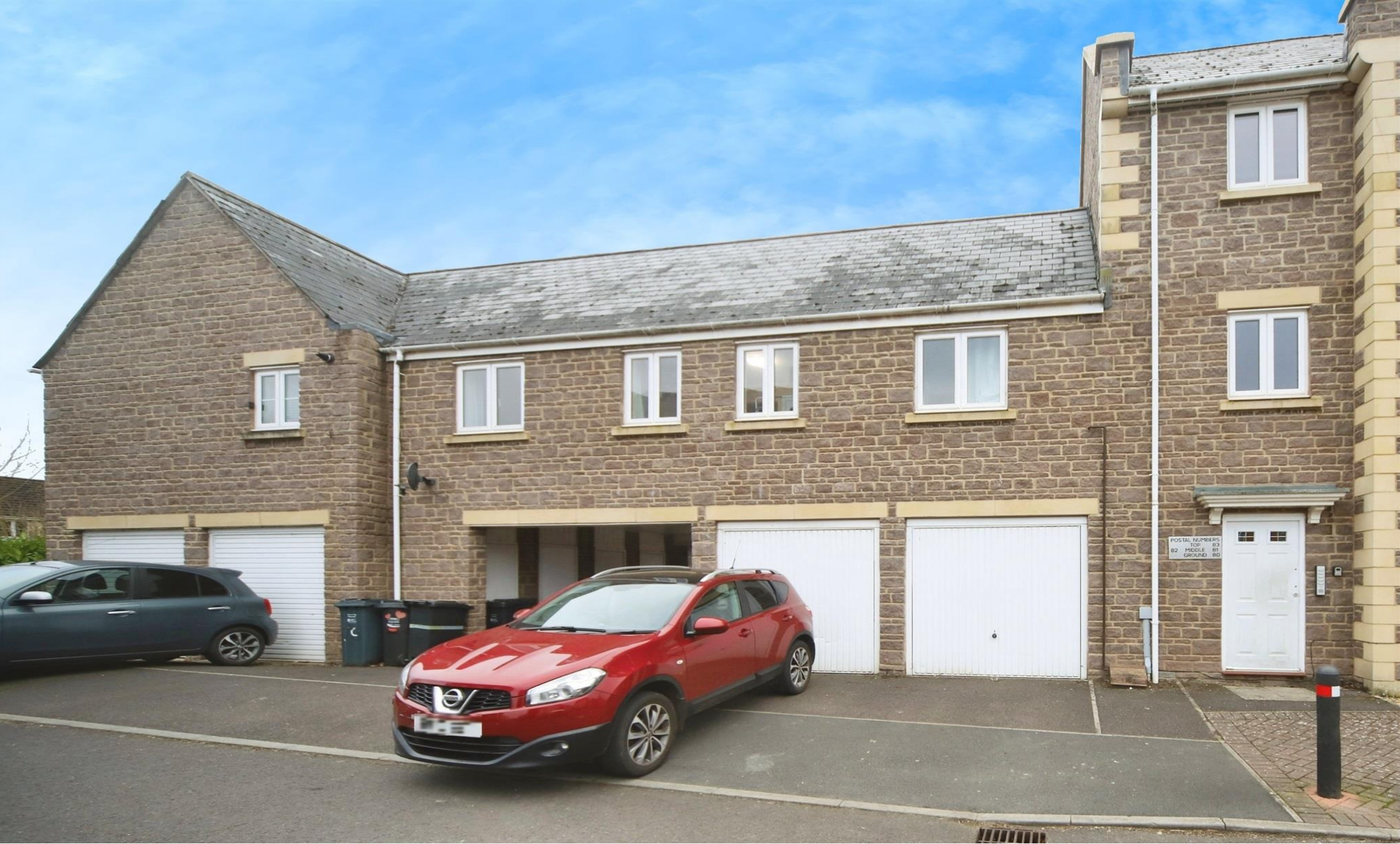
Morse Road, Norton Fitzwarren Taunton TA2 6BS