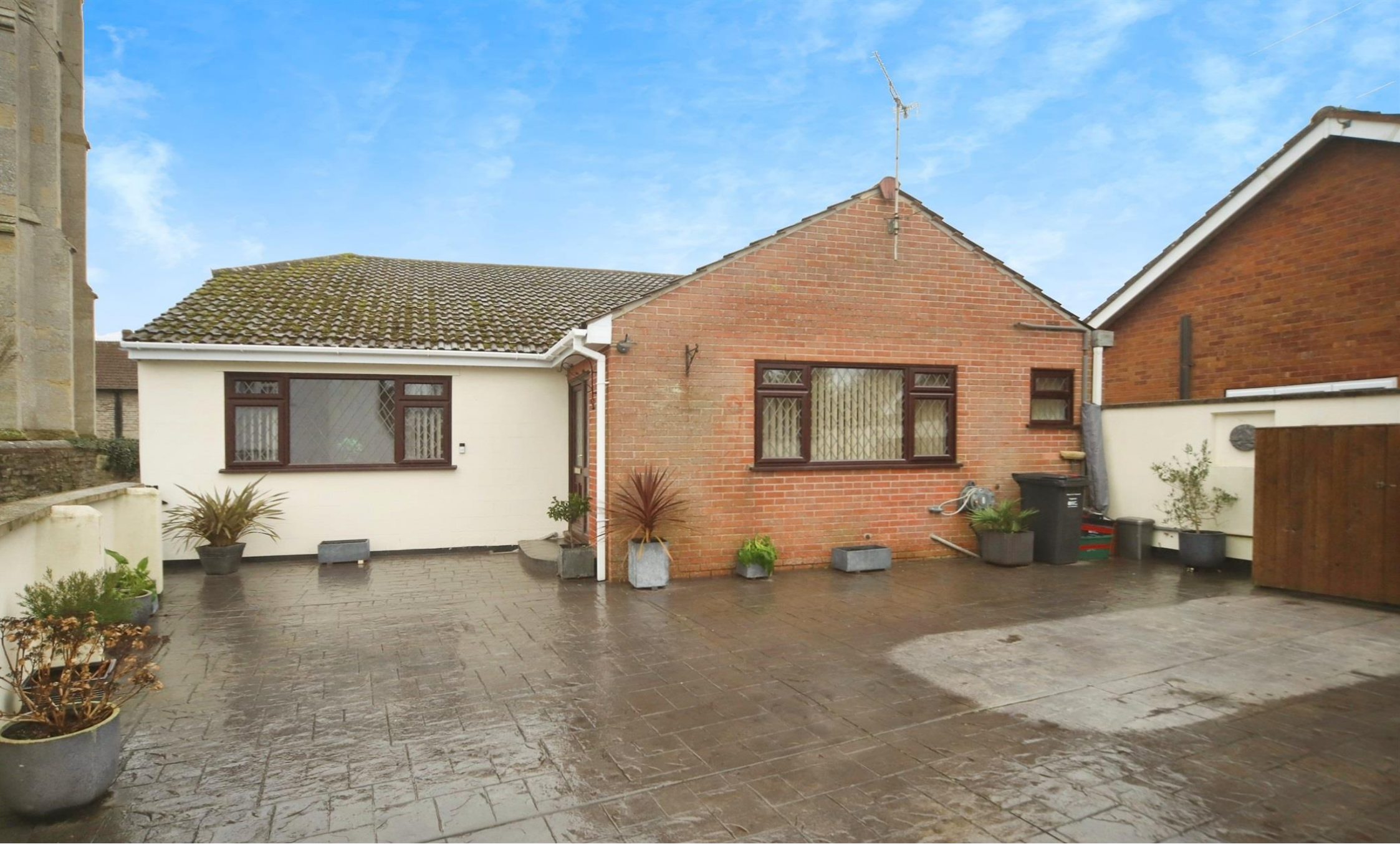
The Bungalow Church Lane, Westonzoyland BRIDGWATER TA7 0EP