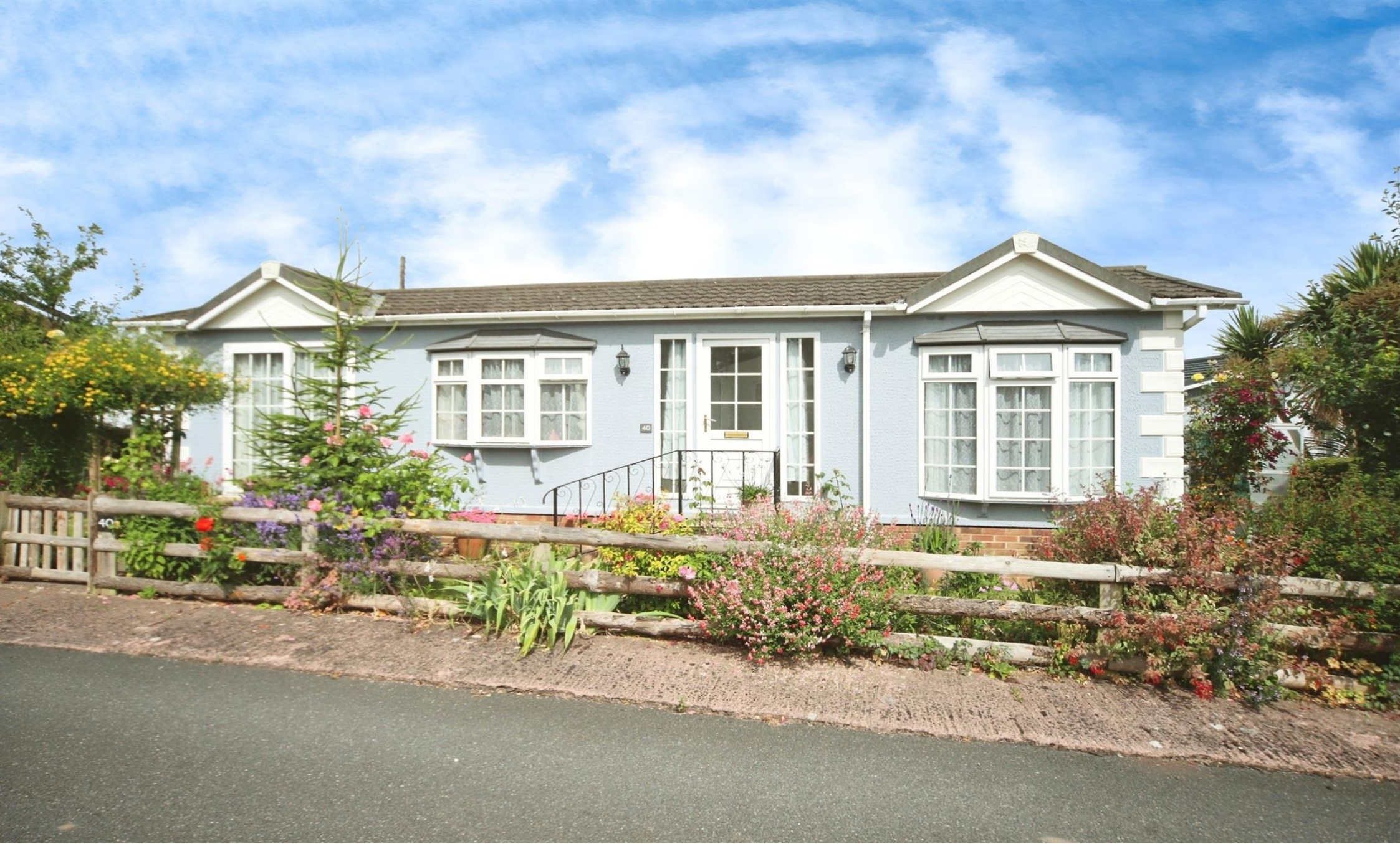
Pitt Farm ,Spy Post Wellington TA21 9PY