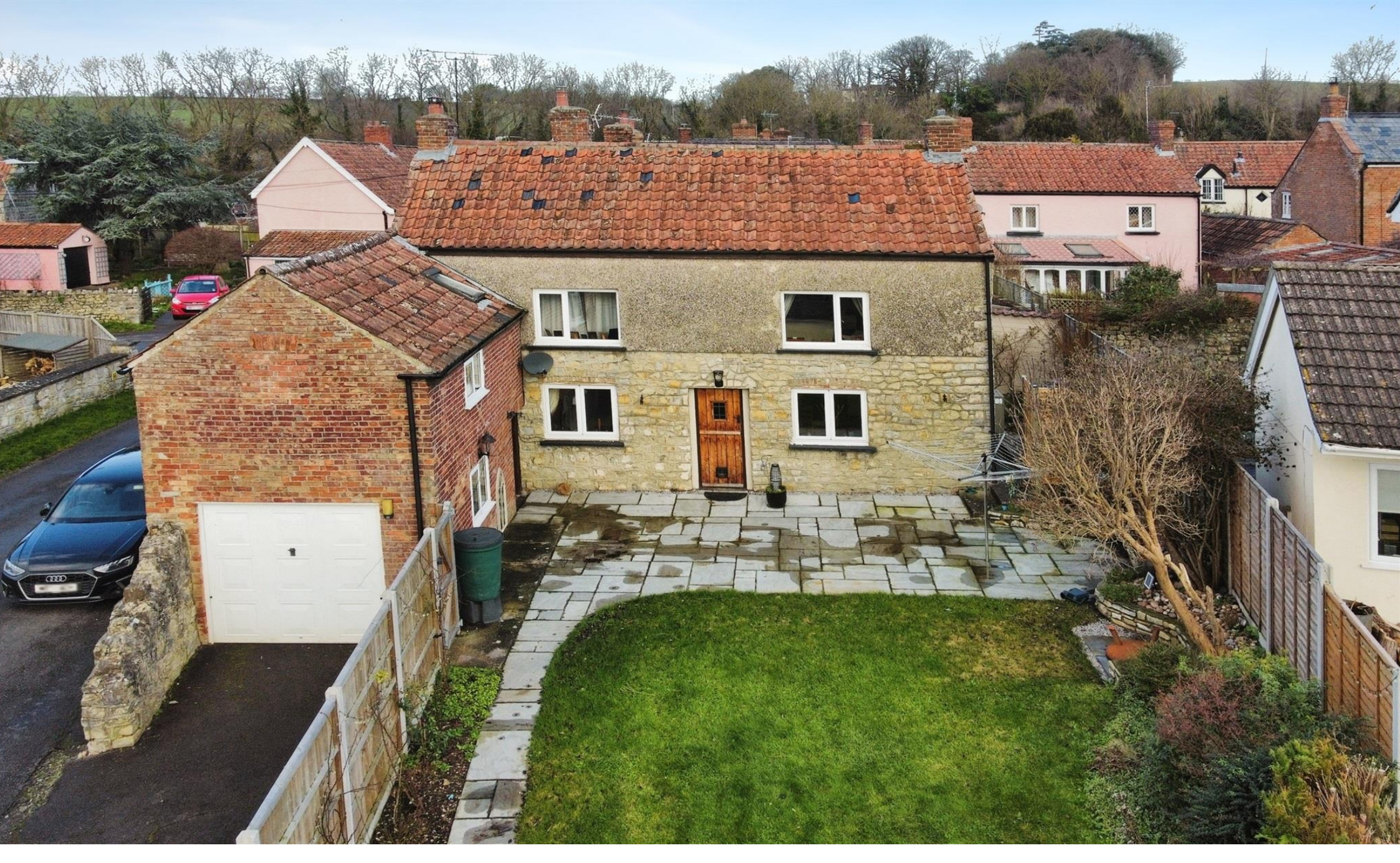
Millstone Cottage Church Road, Bawdrip Bridgwater TA7 8PU