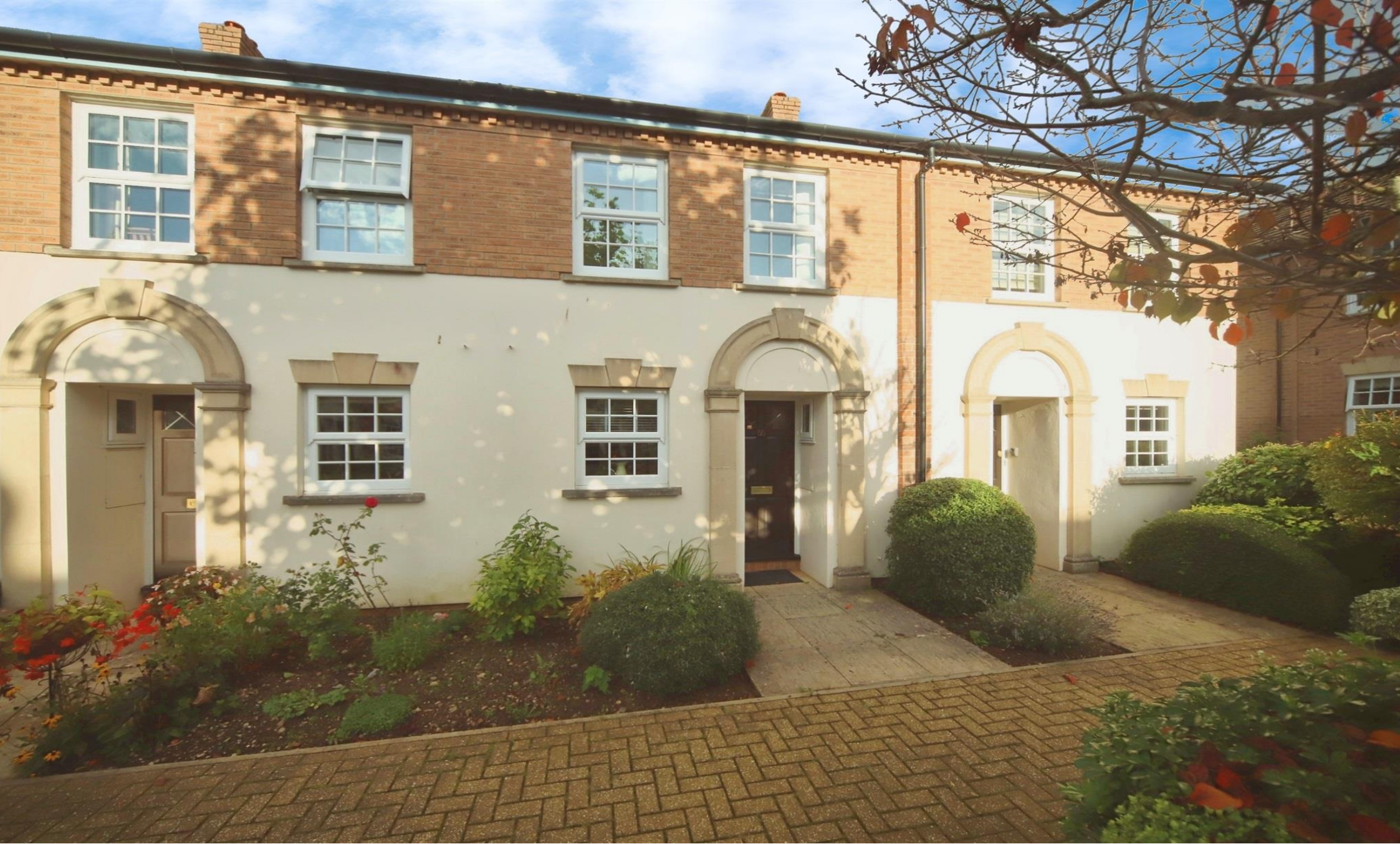
Eastgate Gardens, Taunton TA1 1RE