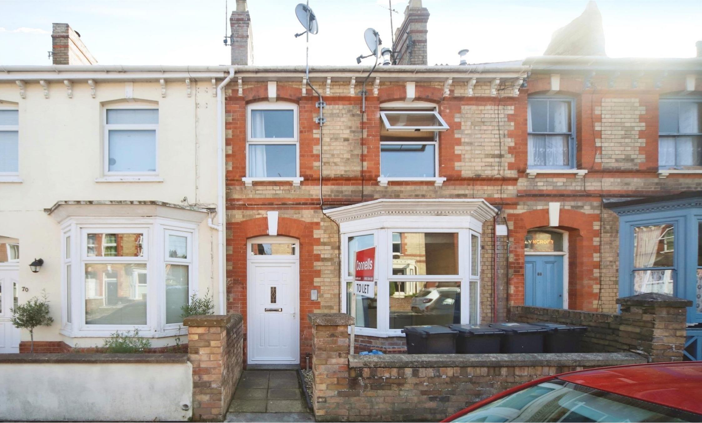
Flat 3 Greenway Avenue, Taunton TA2 6HX