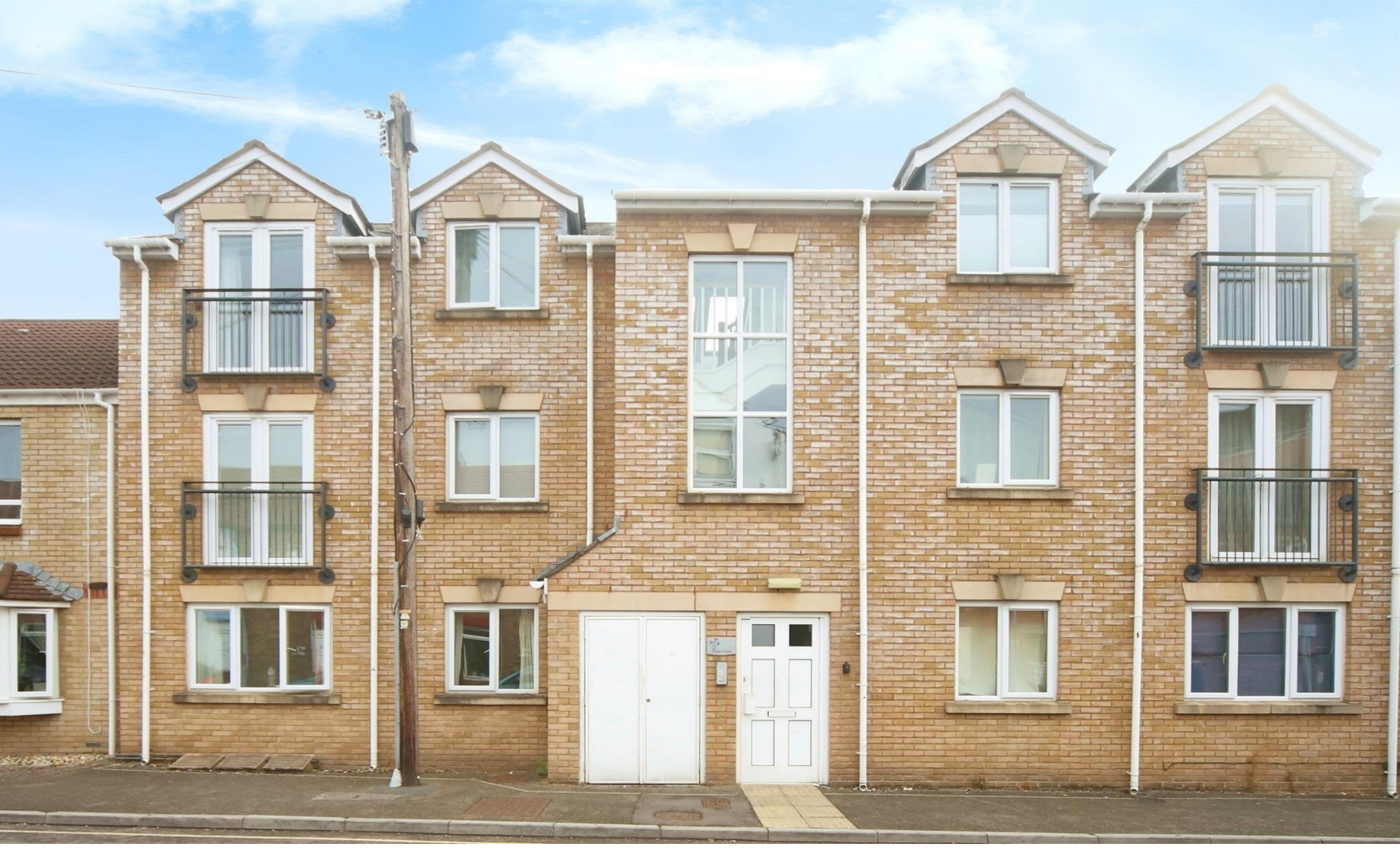
Maple Court Eastbourne Road, Taunton TA1 1TE