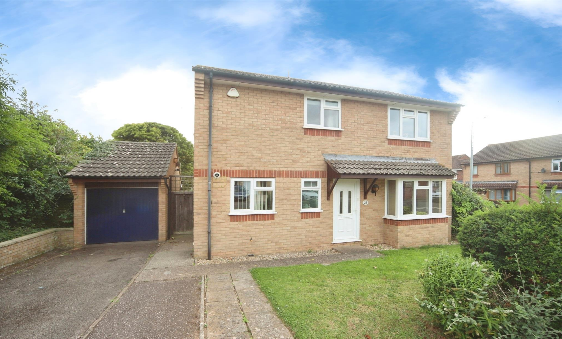
Calder Crescent, Taunton TA1 2NH