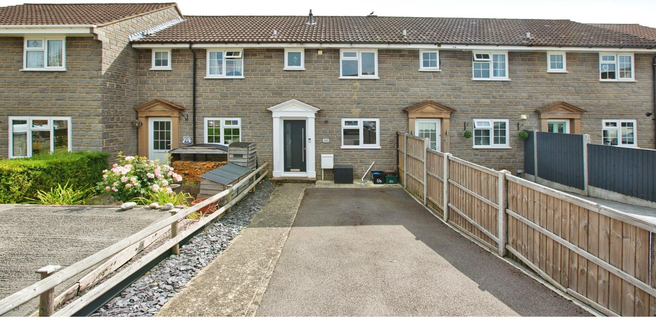
Barrymore Close, Langport TA10 9TD