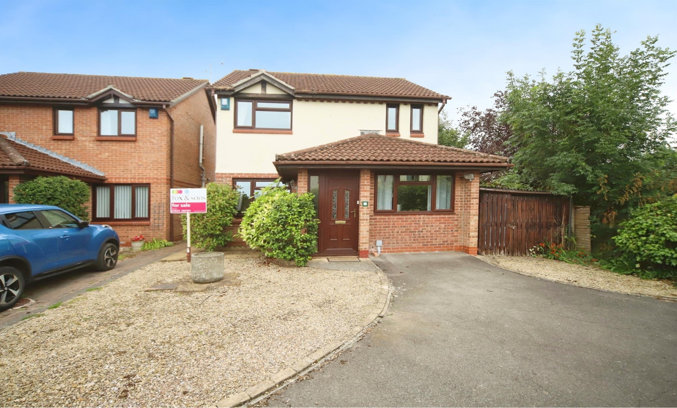
The Oaks, Taunton TA1 2QX