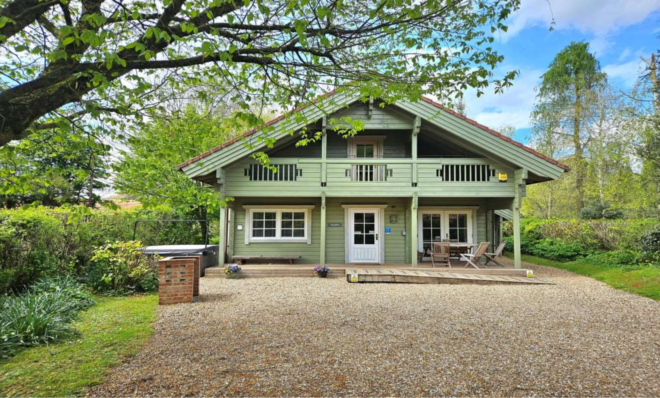
Woodpecker Lodge Parsonage Lane, Kingston St. Mary Taunton TA2 8HL