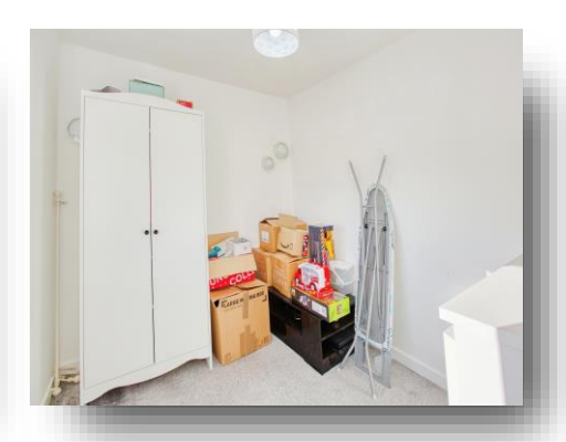
Iris Way B3153 Bartletts El MoliiM Broc