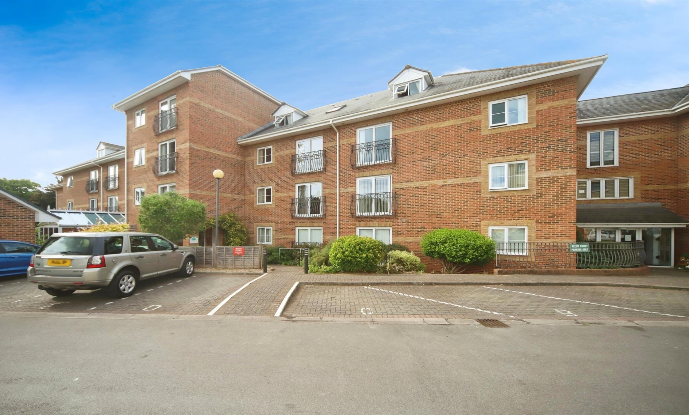
Beech Court Tower Street, Taunton TA1 4BH