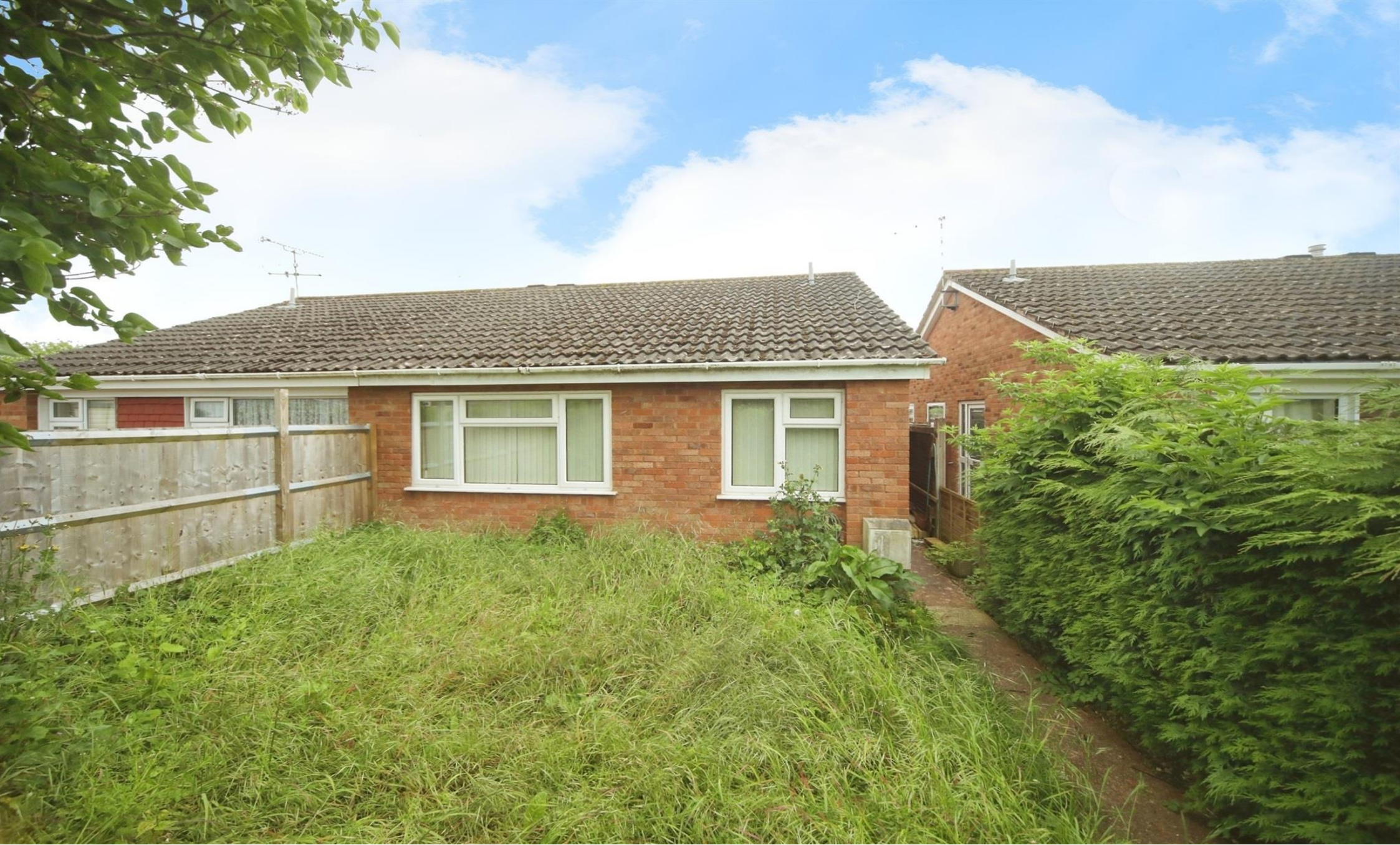
Burchs Close, Taunton TA1 4TS