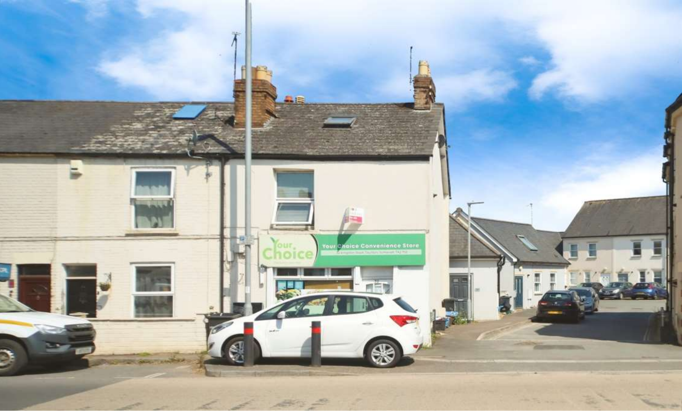
Kingston Road, Taunton TA2 7SE