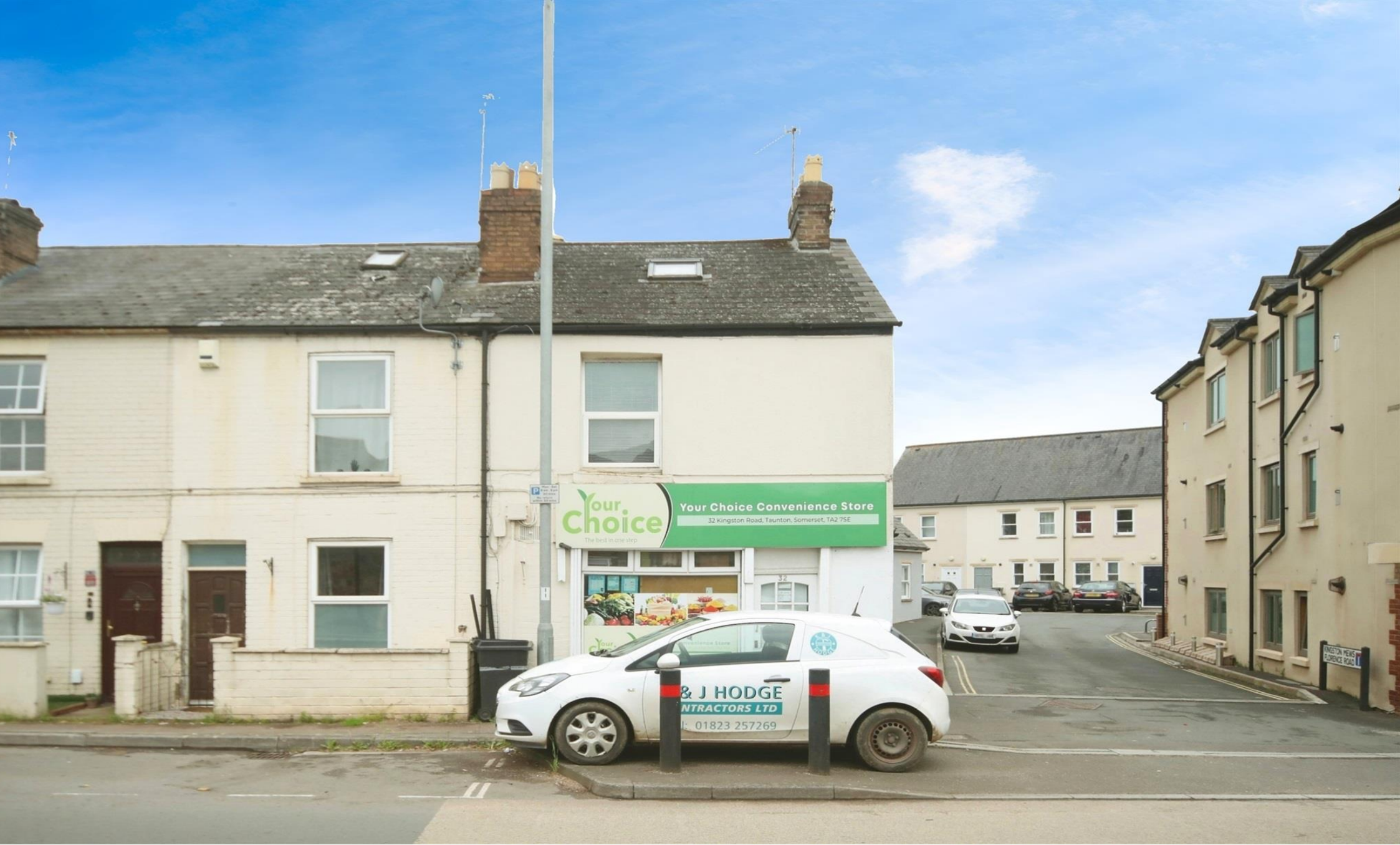
Kingston Road, Taunton TA2 7SE