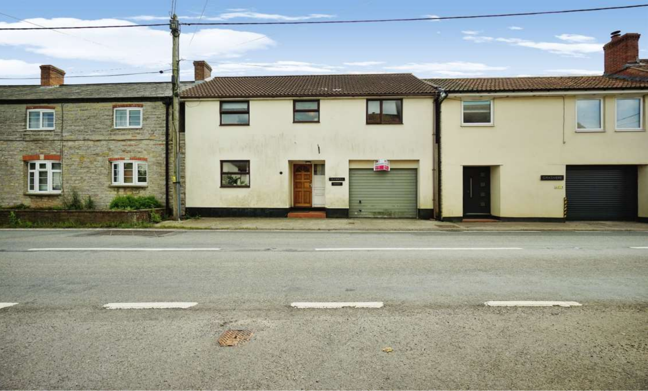
Chadwell House, East Lyng TAUNTON TA3 5AU