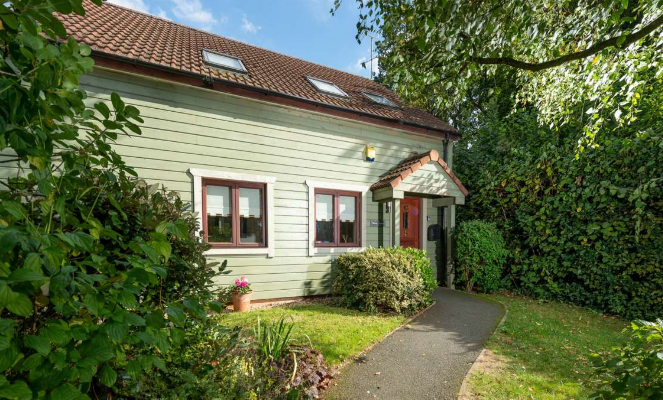
House Martins Cottage Mill Meadows, Kingston St. Mary Taunton TA2 8HL