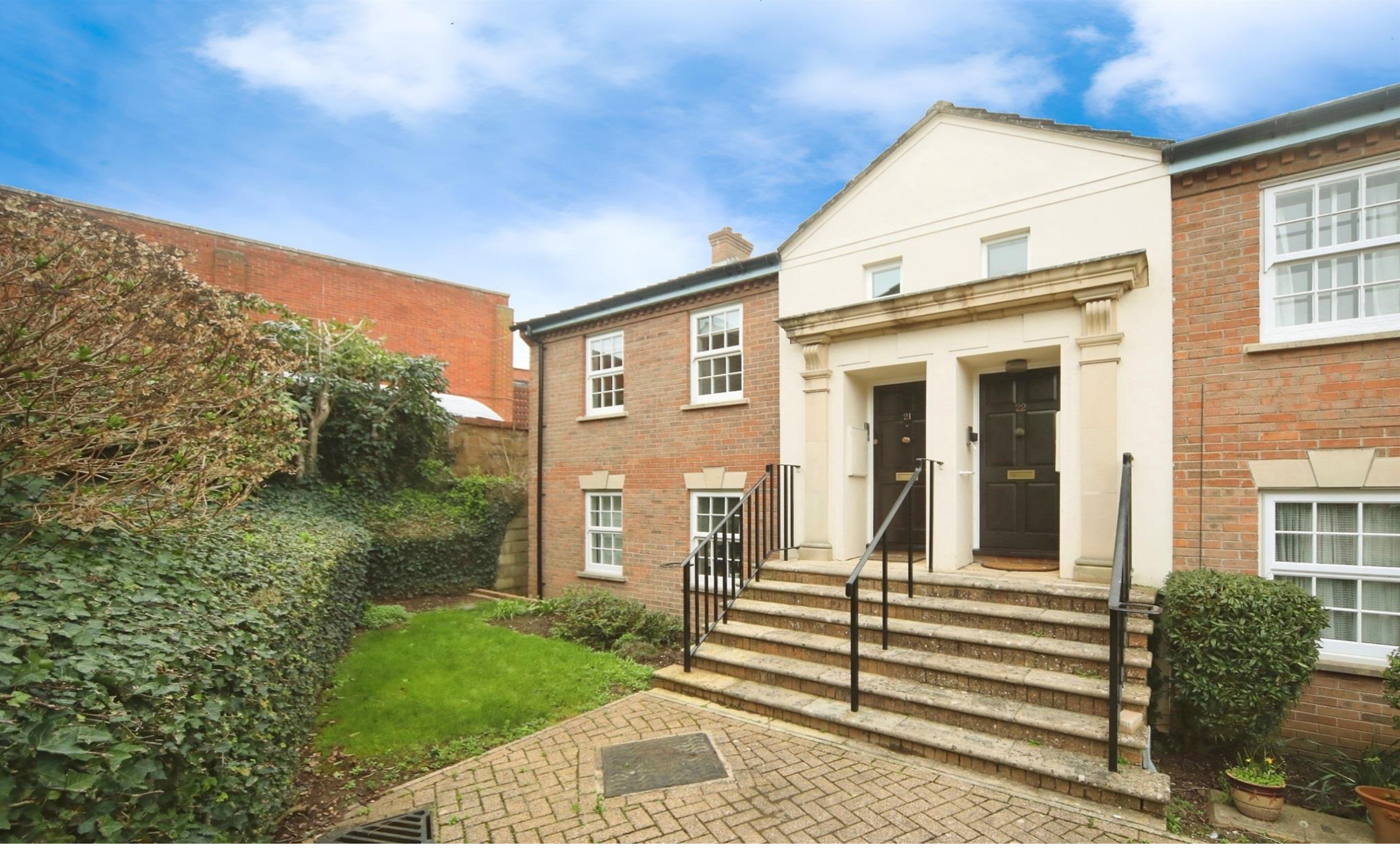
Eastgate Gardens, Taunton TA1 1RD