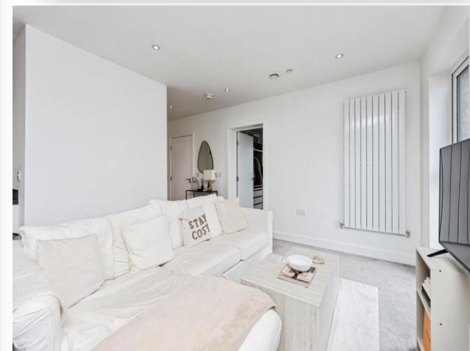
Lacey Way, SELBY YO8 4FS