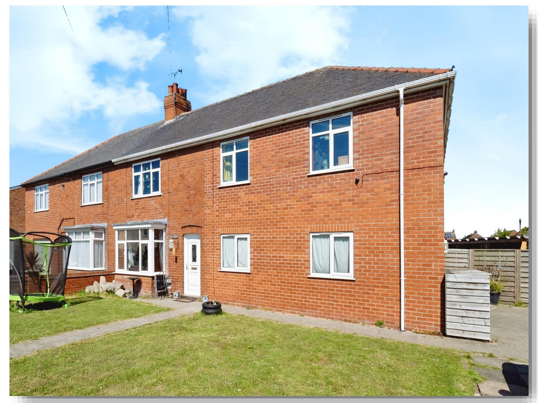
Burnside High Street., Eastrington GOOLEDN14 7PR