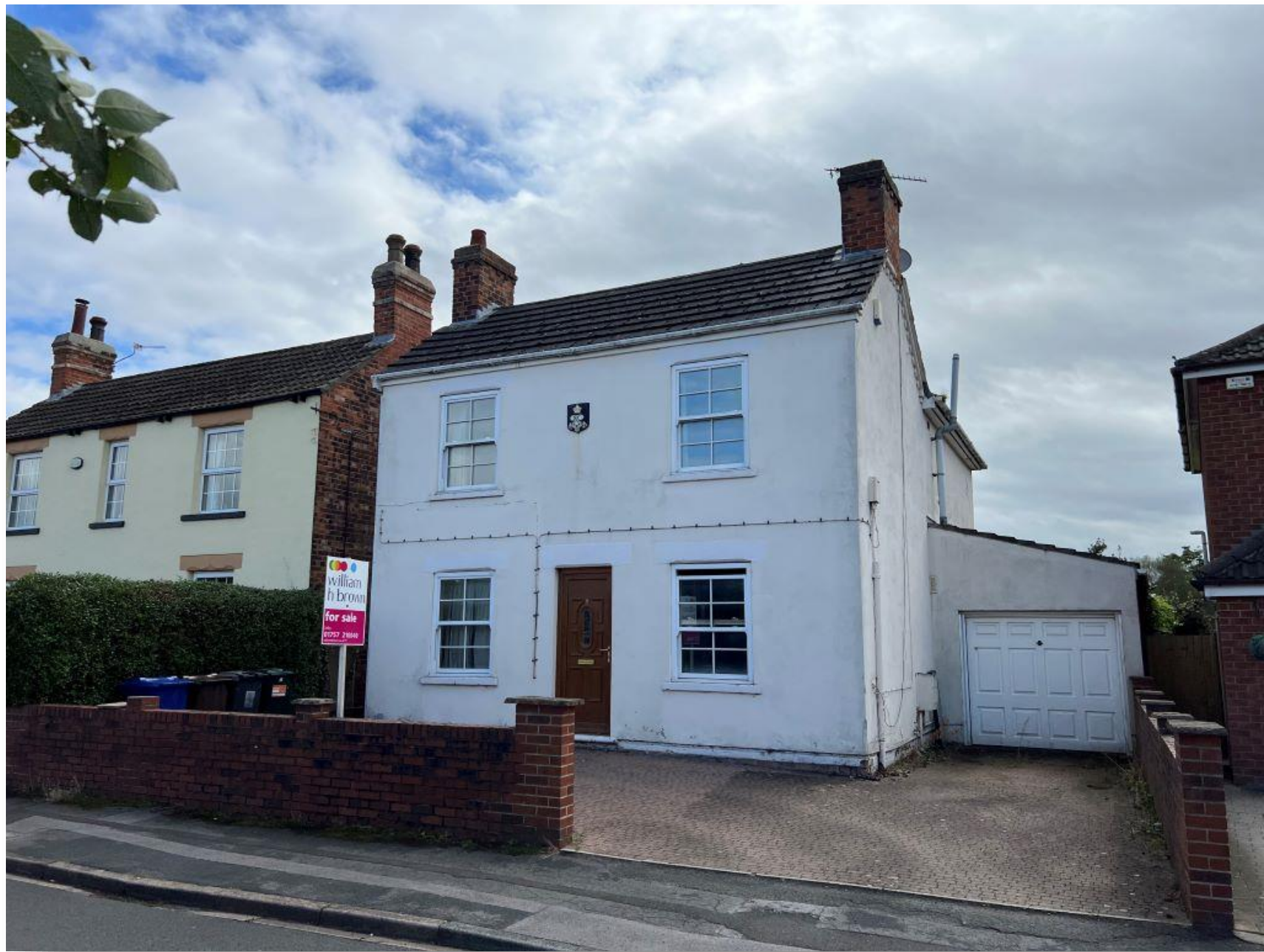
Meadow Croft, Brayton Selby YO8 9EJ