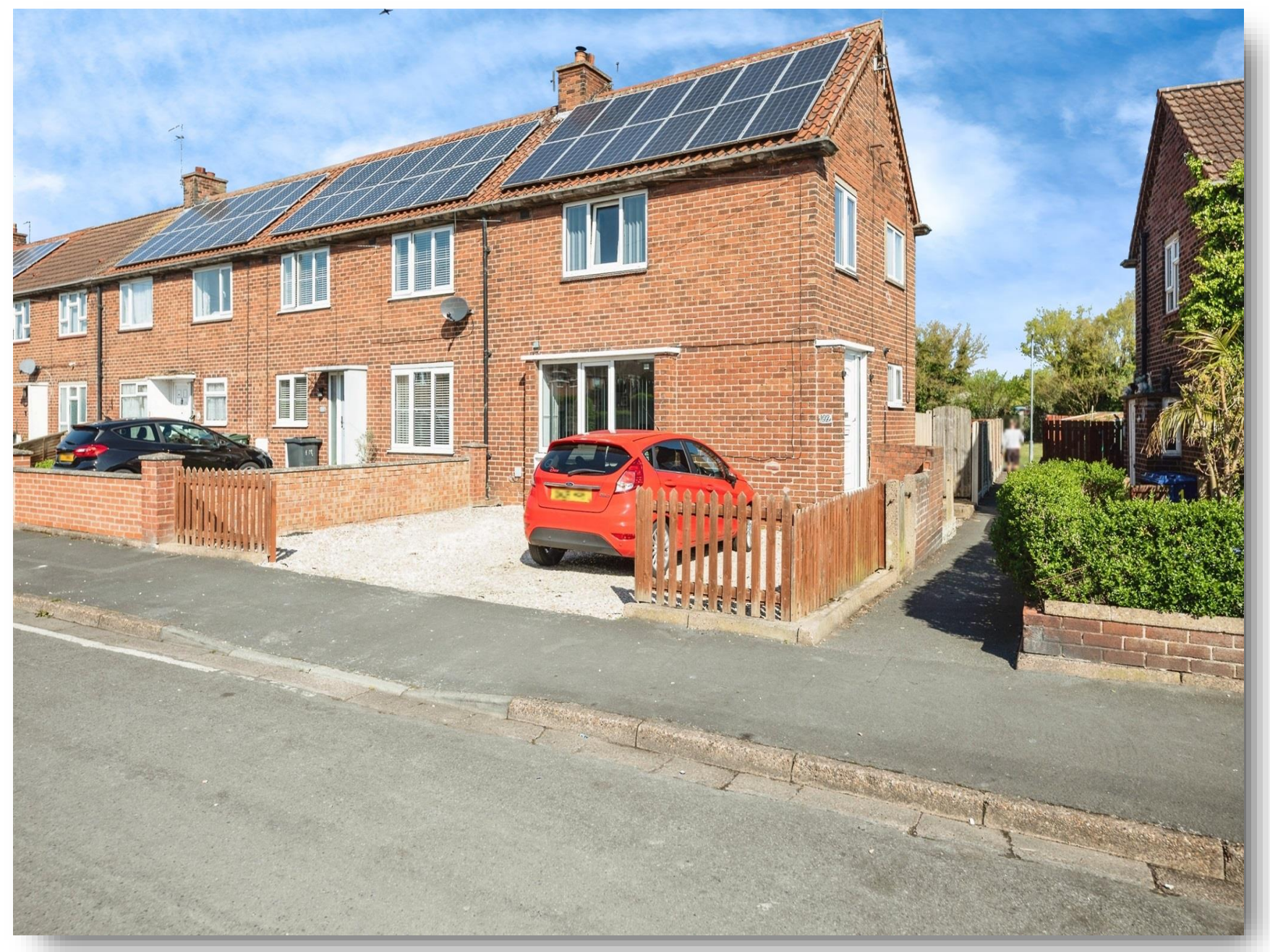
Petre Avenue, SelbyYO8 8DW