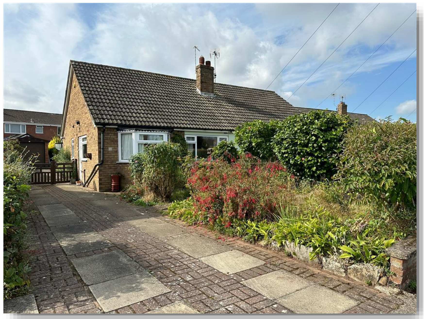
Barff Close, Brayton SelbyYO8 9ES