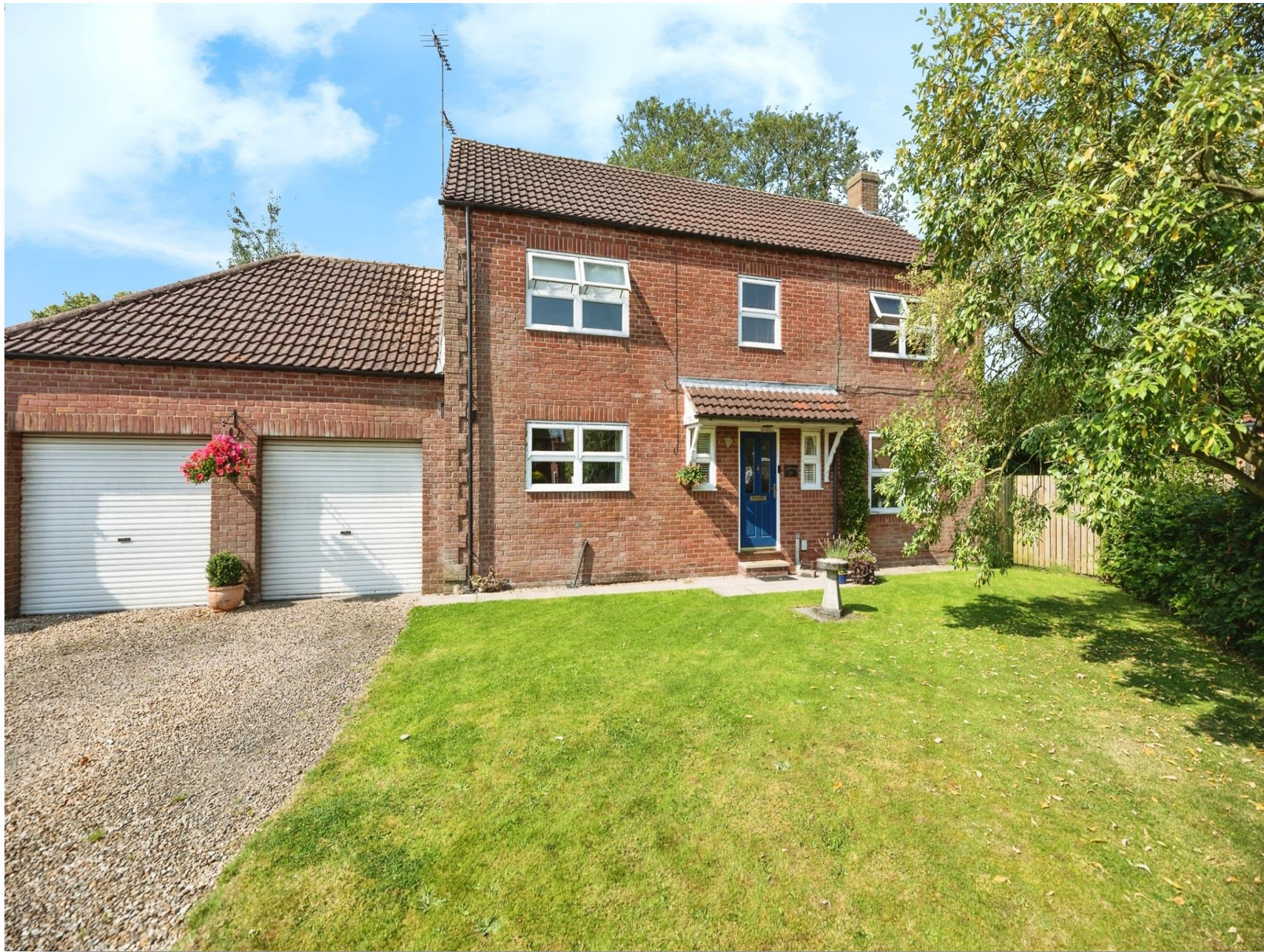
The Green, Wistow Selby YO8 3FS