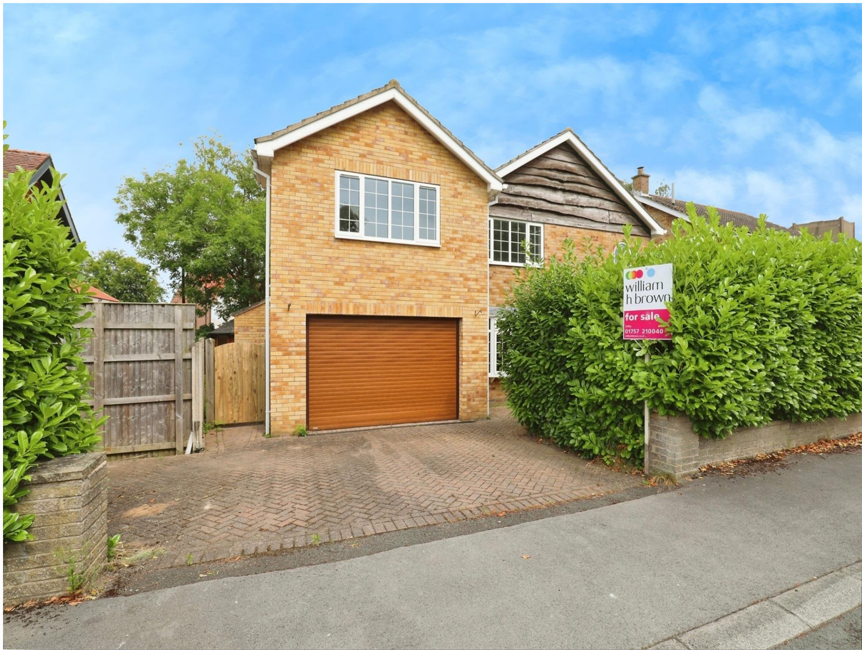
Manor Garth, Riccall York YO19 6QX