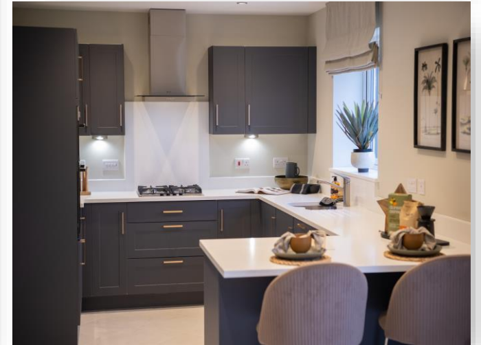
Maiden Way, Eggborough Goole DN14 0SA