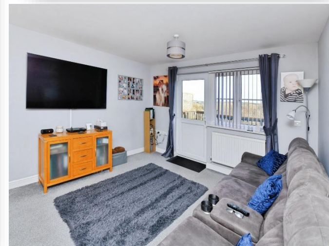
Grassmere Way, Pillmere Saltash PL12 6XF