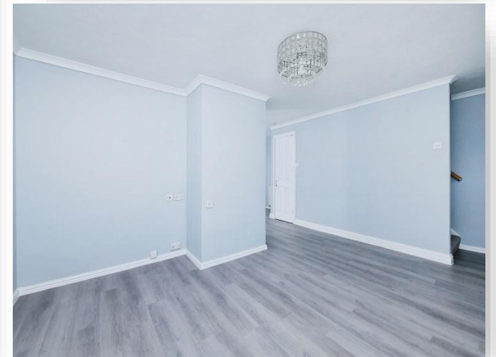
Buller Park, Saltash PL12 4LD