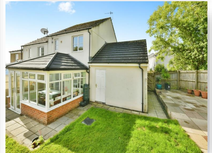
Grassmere Way, Pillmere Saltash PL12 6XE