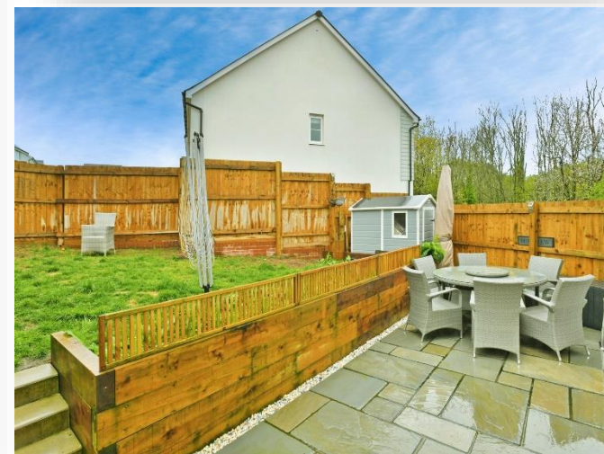
Hawkins Lea, Carkeel Saltash PL12 6GN