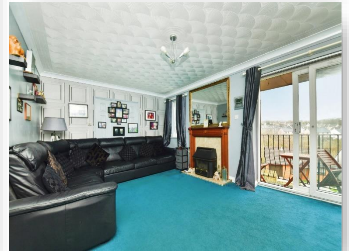
The Brook, Saltash PL12 6UL