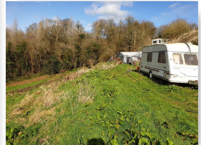
Pine Ridge Farm, Trevigro Callington PL17 7JT